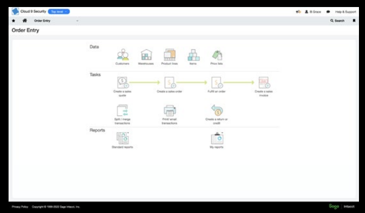
Quickly access specific order management tasks or data using visual navigation.